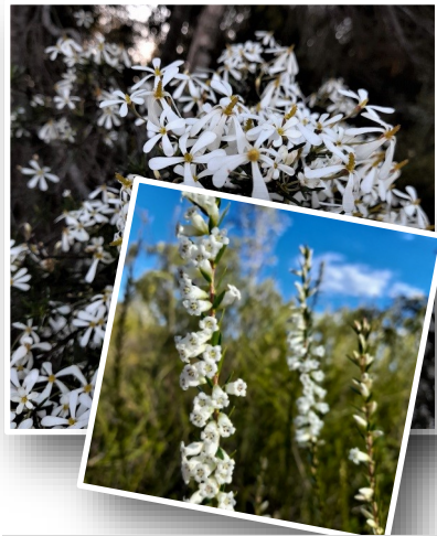
Wedding Bush and white heath.

The second bus trip was for our Branch of Wildlife, and we went to Tuan, Poona and Tinnanbar. The display was excellent. However, a trip down a week later saw some flowers past their peak, but others just coming on... to mention a few.. wild iris, vanilla lily and swamp boronia. In the past 6 years we have taken approx. 500 people to see the wildflowers, and that's not including the number of Camera Club trips we have led to the area. Ref Wambaliman July/August/September 1986.