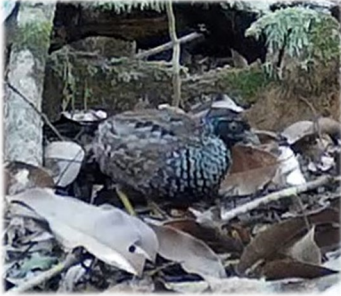
Above: A still taken from trail-camera footage of the Black-breasted Button-quail at Takura Environmental Reserve.