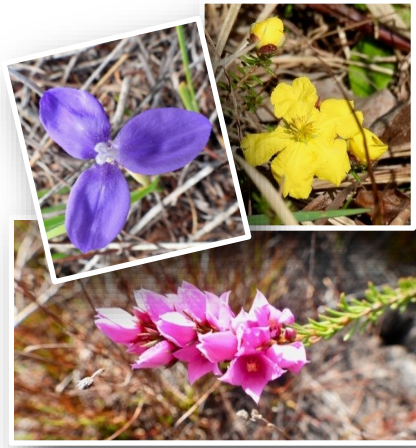
Purple Flag (Wild Iris), Guinea flower & boronia.