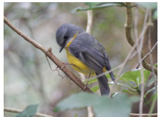
Eastern Yellow Robin, Bunya National Park