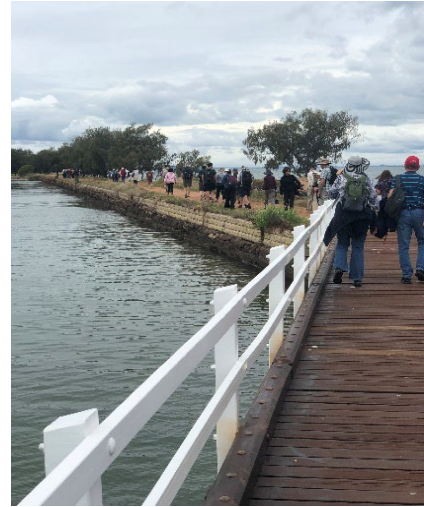
Jetty St Helena