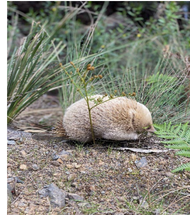
Echidna Bruny Island Tasmania