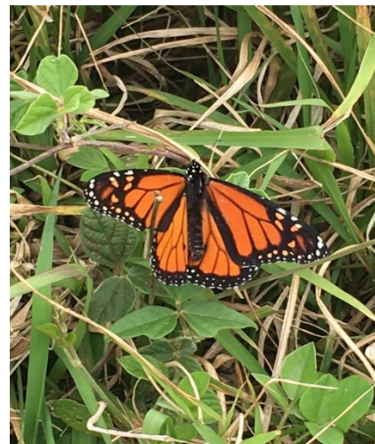
Monarch Butterfly Belinda Homewood