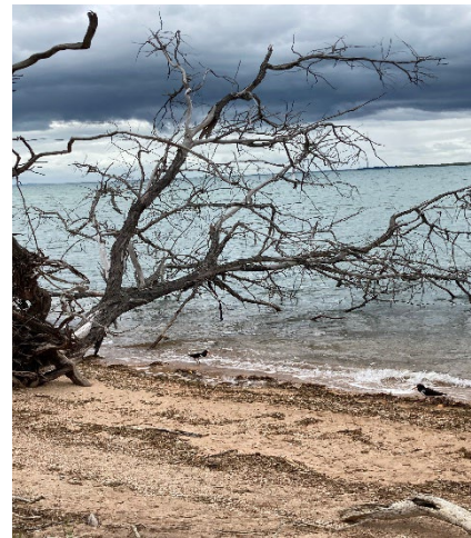
Island Beach under stormy skies Tracey Mann