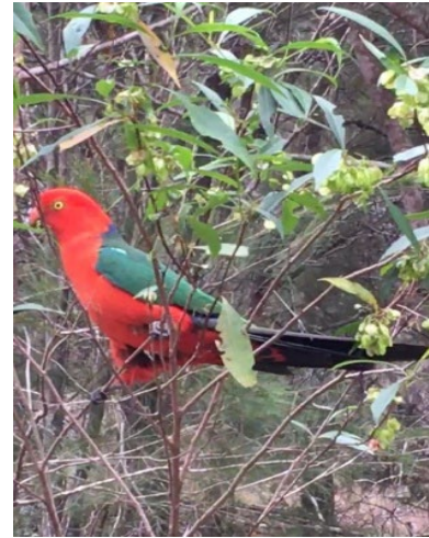
King Parrot Alexandra Hills

Recently the Federal Environment minister Tanya Pliibersek announced Threatened Species Action Plan "Towards Zero", very laudable, but there have been several plans in the past, they often fail because the Federal government has little control over land clearing by the states and from a lack of funding commitment.