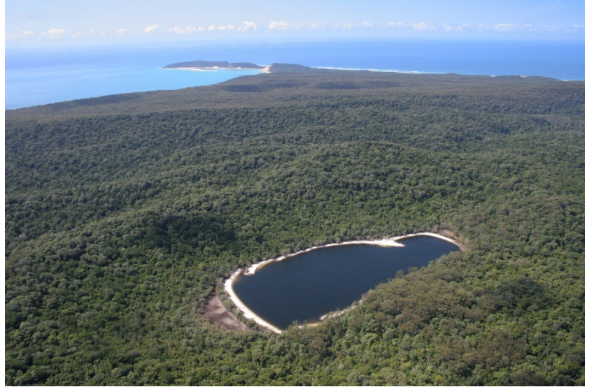
Lake Poona